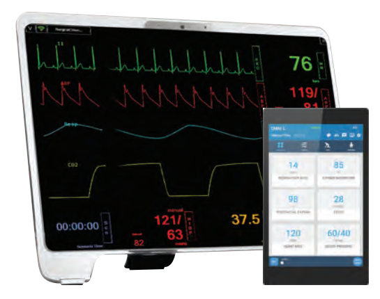
Virtual patient monitor sold separately. Product model may vary from the one shown.