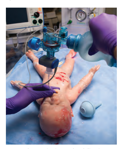
Neonatal resuscitation and stabilization