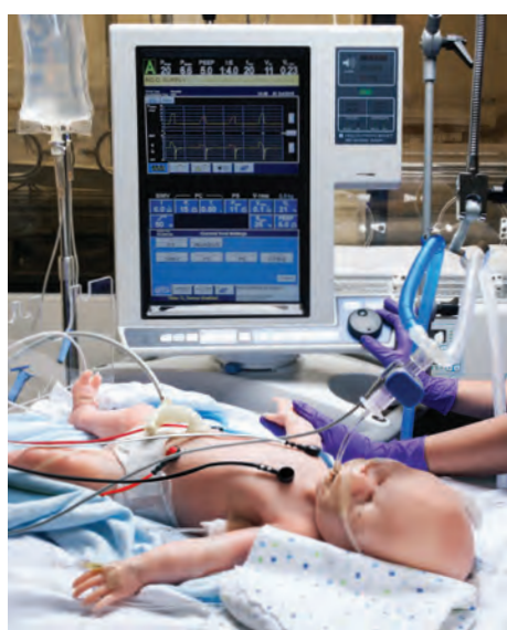
Real mechanical ventilator and patient monitor support