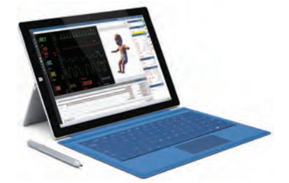
UNI® Interface powered by Microsoft® Surface