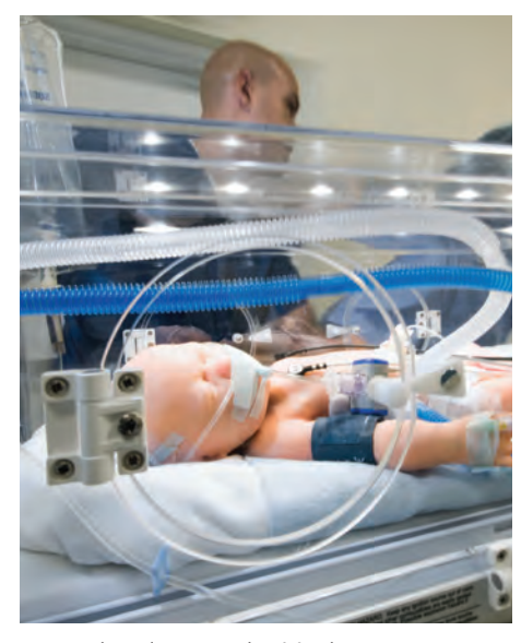
Internal and external critical care transport