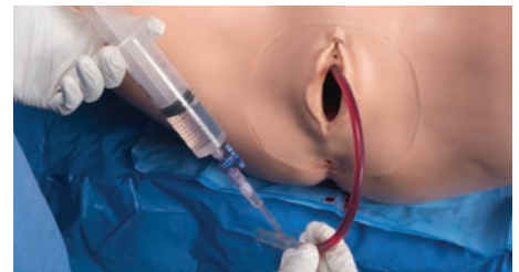
Cervix and uterus allow for tamponade placement and hemorrhage control