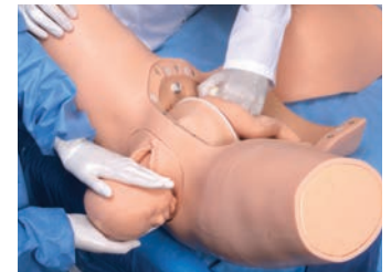
Removable abdomen offers an internal view of the birth