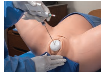
Vacuum cup application, suctioning, and traction