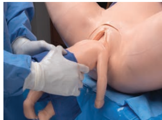
Breech maneuvers: Pinard's, Mauriceau, Ritgen's, Lovset

The neonate's smooth skin and articulated limbs support the use of real instruments and advanced maneuvers.