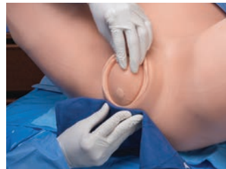
Illustrate descent, rotation, and expulsion