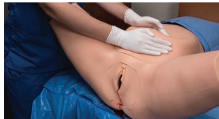
Soft abdomen and adjustable uterine tone for massage training