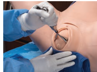
Forcep indication, application, and traction