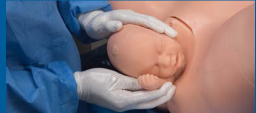
Articulated joints provide realistic resistance