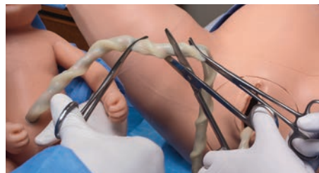
Umbilical cord clamping and cutting