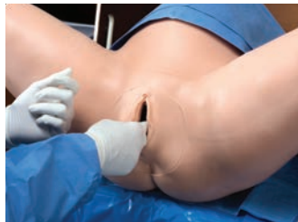
Palpable pelvic landmarks and dilating cervix