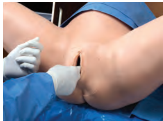
Palpable pelvic landmarks and dilating cervix