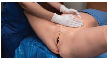
Soft abdomen and adjustable uterine tone for massage training