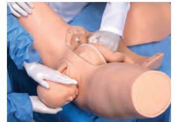
Removable abdomen offers an internal view of the birth