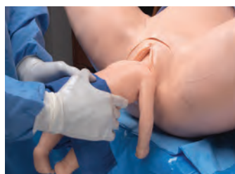
Breech maneuvers: Pinard's, Mauriceau, Ritgen's, Lovset

The neonate's smooth skin and articulated limbs support the use of real instruments and advanced maneuvers.