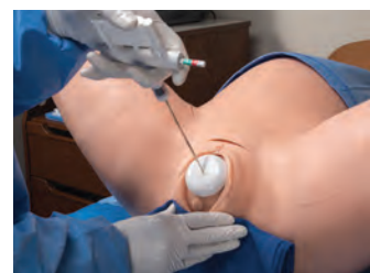
Vacuum cup application, suctioning, and traction