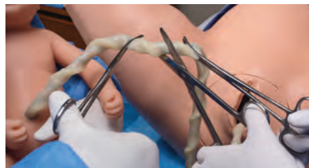
Umbilical cord clamping and cutting