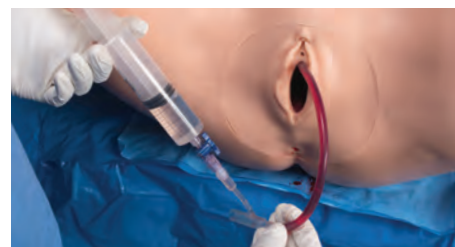
Cervix and uterus allow for tamponade placement and hemorrhage control