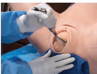
Forcep indication, application, and traction