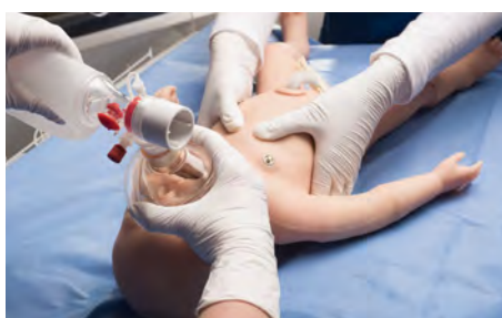
CPR quality sensors