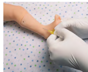
IV access with drain port for infusion