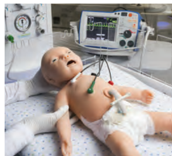
Monitor using real devices