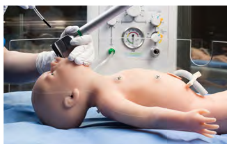
Neck hyperextension sensor