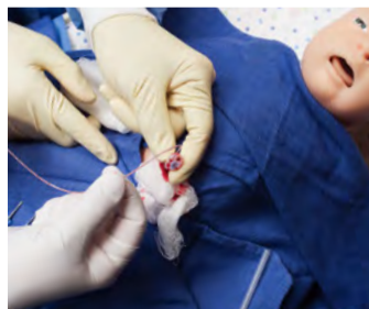
Arterial/venous umbilical cath.