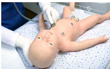
Heart and lung sounds