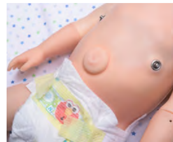
Navel insert post cord detachment