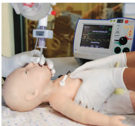
Monitor respiration and EtCO 2 using native monitoring devices