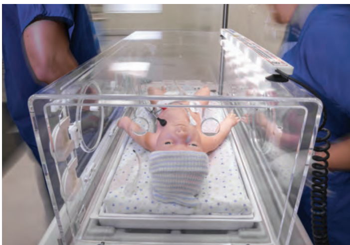
Wireless and tetherless operation

TORY is fully functional while on battery power for up to 4 hours. There are no distracting controller wires or tethered external compressors. Our proven wireless and tetherless technology lets you easily simulate transitional care scenarios to improve inter and intra-disciplinary teamwork and communication.