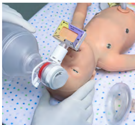
Detect CO 2 exhalation using real devices